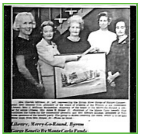
Monte Carlo Níght raises funds for Civic Projects in Greenwich.