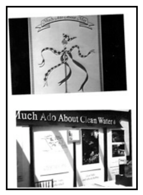
"Much Ado About May" 1996 flower show held at St. Mary's on Greenwich Avenue-